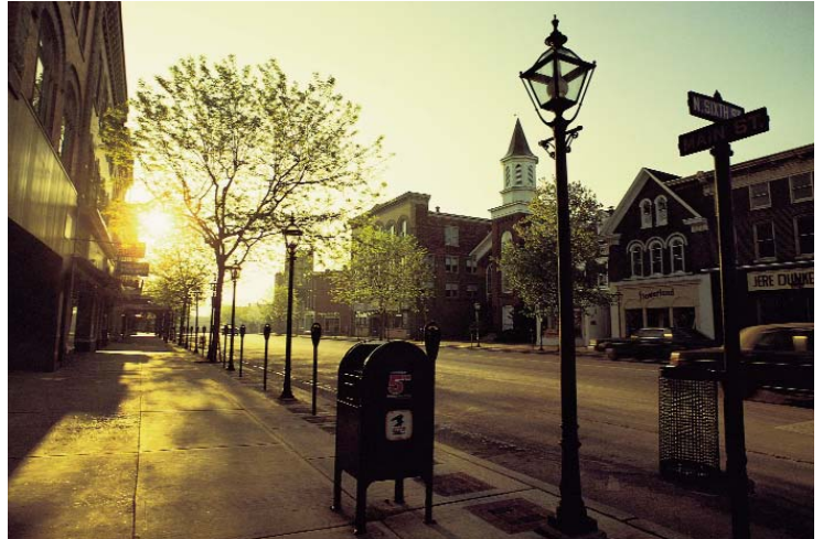
Rural communities often lack access to private and public capital, making it difficult for them to obtain funds for economic development and revitalization.

From a land use and development perspective, rural America includes towns and small cities as well as working lands, or lands that are managed for economic value such as farms, prairies, forests, and rangelands. Historically, rural land was often used for the production and extraction of resources. Towns were developed at transportation hubs – rail stations, river ports, major crossroads – providing the places where agricultural or natural resources could be traded or shipped. Many rural communities were built around main commercial streets and relatively compact, walkable neighbor-