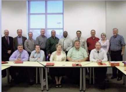
Northern Illinois University and LCBI coalition.

In September, 2010 NIU received $46.1 million in federal dollars matched with nearly $14 million in state capital funds and $6.5 million in private funding for the project. The LaSalle County portion of the project will include installation of over 180 miles of fiber across the county. Forty-eight (48) strands of the fiber will be publicly owned. The grant funds will also be used to directly connect over 200 Community Anchor Institutions.